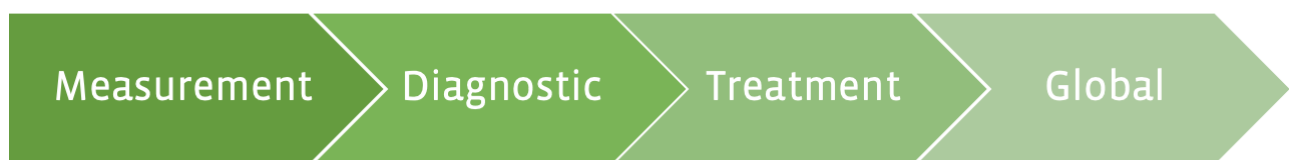
Figure 3. Continuum of mHealth tools 8

Although many mHealth apps currently exist, there is still a need for improvements. The utilisation of mHealth tools continues to increase. However, this can pose a problem for those who do not wish to download multiple apps. There